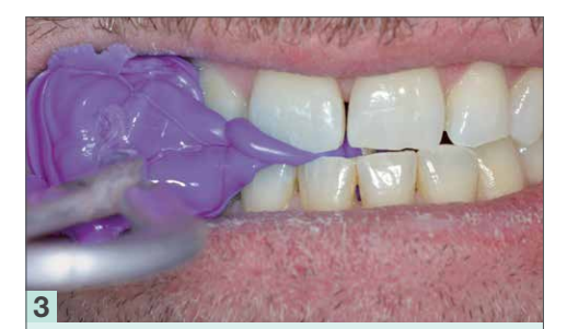
Place the impression tray immediately upon completing the syringing of the Light Body. Ask the patient to passively close. If no segmental bite registration has been taken prior to the impression, the patient may need to be guided into position.