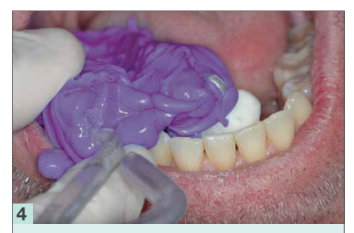
While holding the tray by the sides, gently remove the impression from the patient's mouth. Never torque the handle of the tray to prevent bending of the aluminum body.